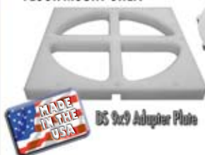
DS 9x9 Adapter Plate