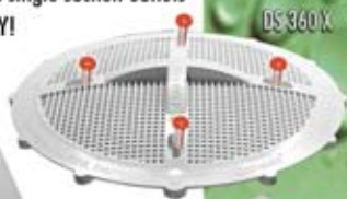
DS 360 X